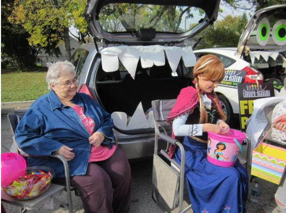
Point Place Princess Parties