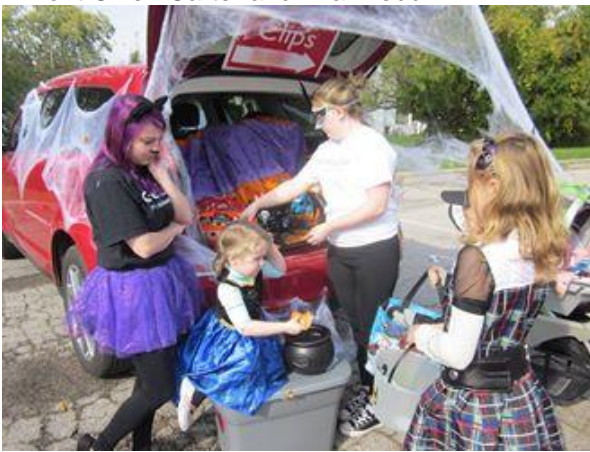
Great Clips on Suder Ave