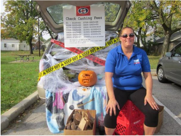
In & Out Mart